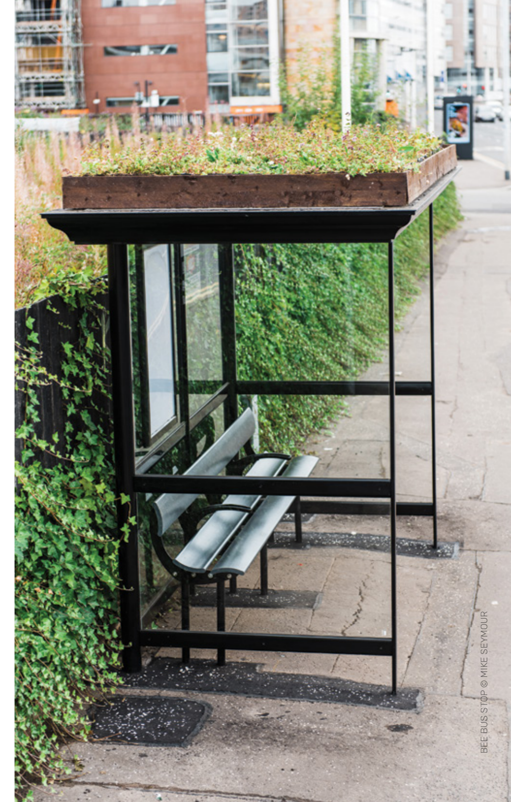
BEE BUS STOP

Keen to help drive net zero initiatives and manage its environment and community impacts, Siemens donated value in kind consultancy to examine the feasibility of installing electric vehicle charging points across Wildlife Trust nature reserves and visitor centres. This has been an invaluable resource, which contributes to Wildlife Trusts 'getting our own house in order', a commitment in our Strategy 2030, and helping us to reduce our scope 1 and 3 emissions, as we tackle the nature and climate emergencies.