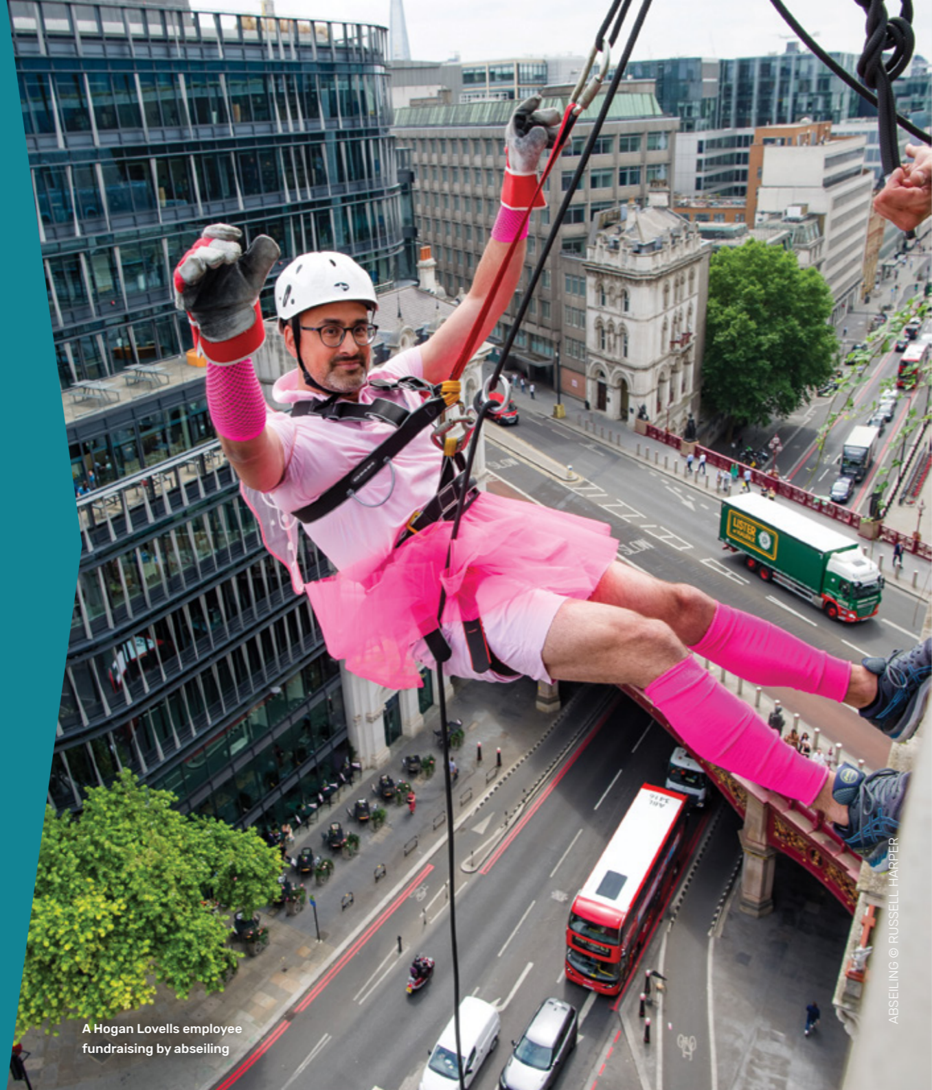
A Hogan Lovells employee fundraising by abseiling