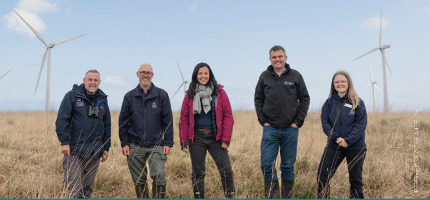
RESERVE VISIT