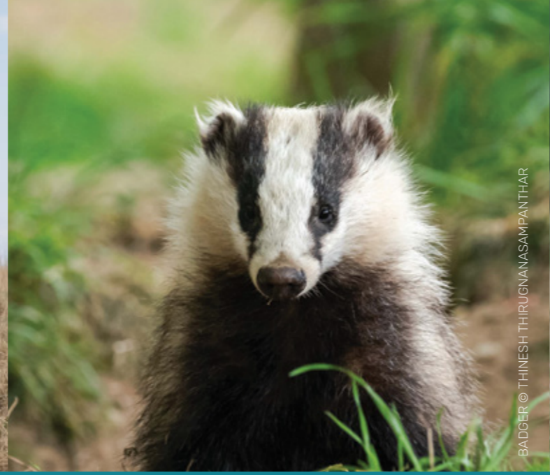
BADGER