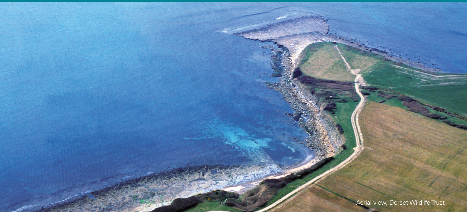
Aerial view, Dorset Wildlife Trust