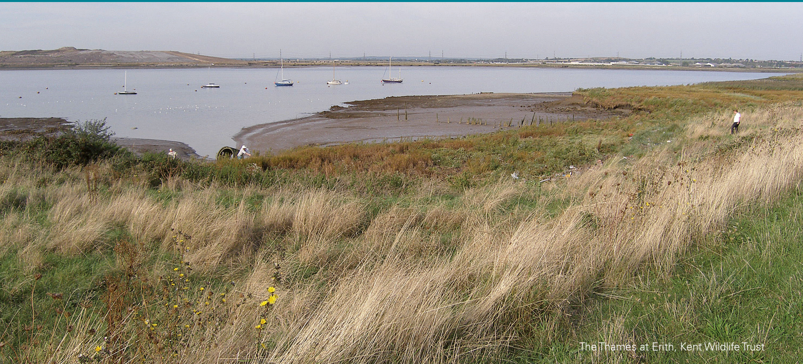
The Thames at Erith