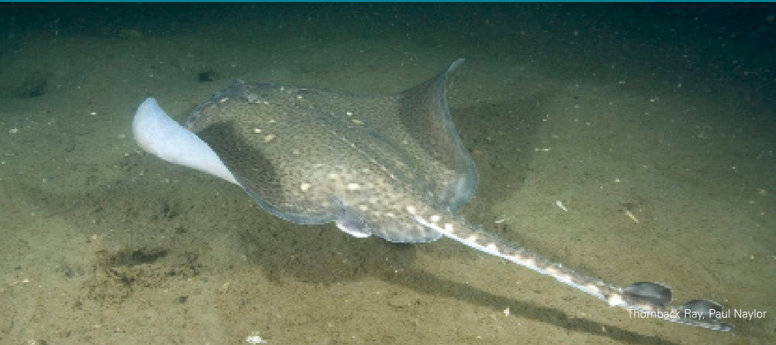
Thornback Ray