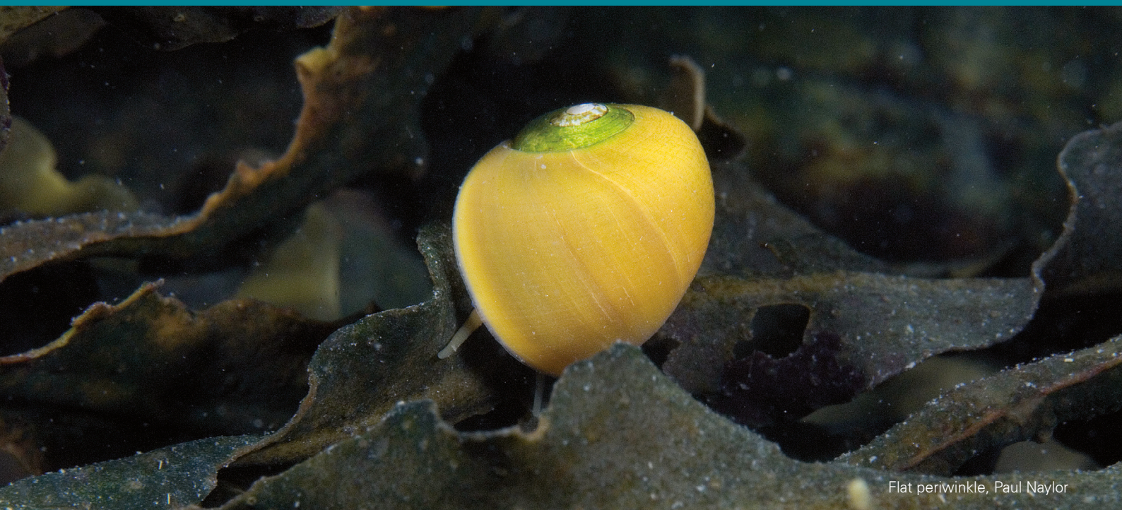
Flat periwinkle