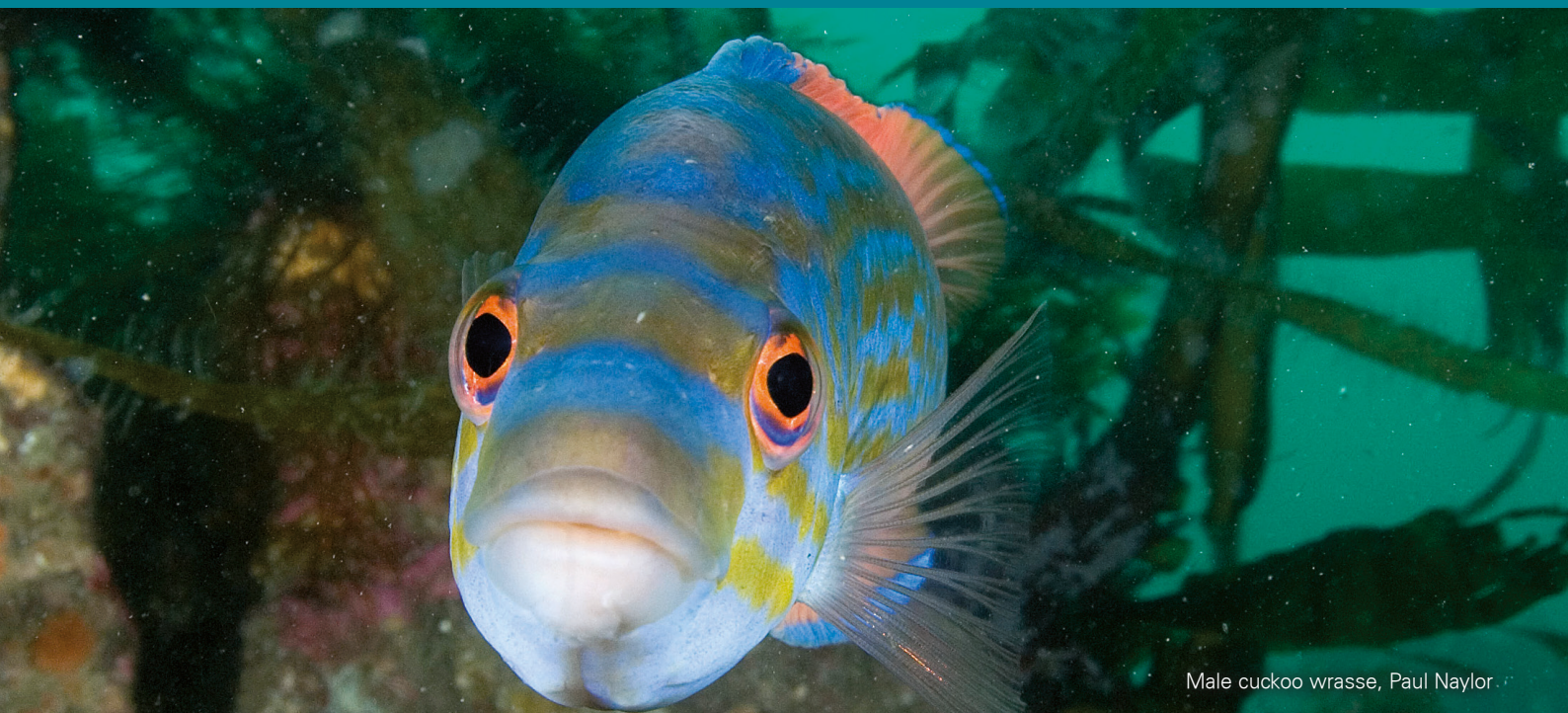
Male cuckoo wrasse