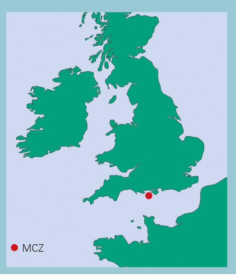
Albert Field 192km<sup>2</sup> Marine Conservation Zone (MCZ)