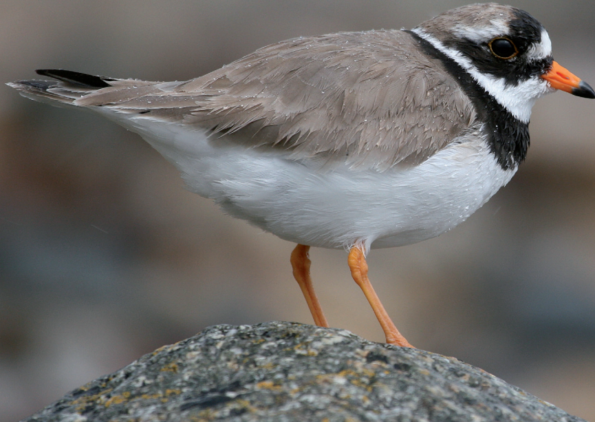
Little ringed plover