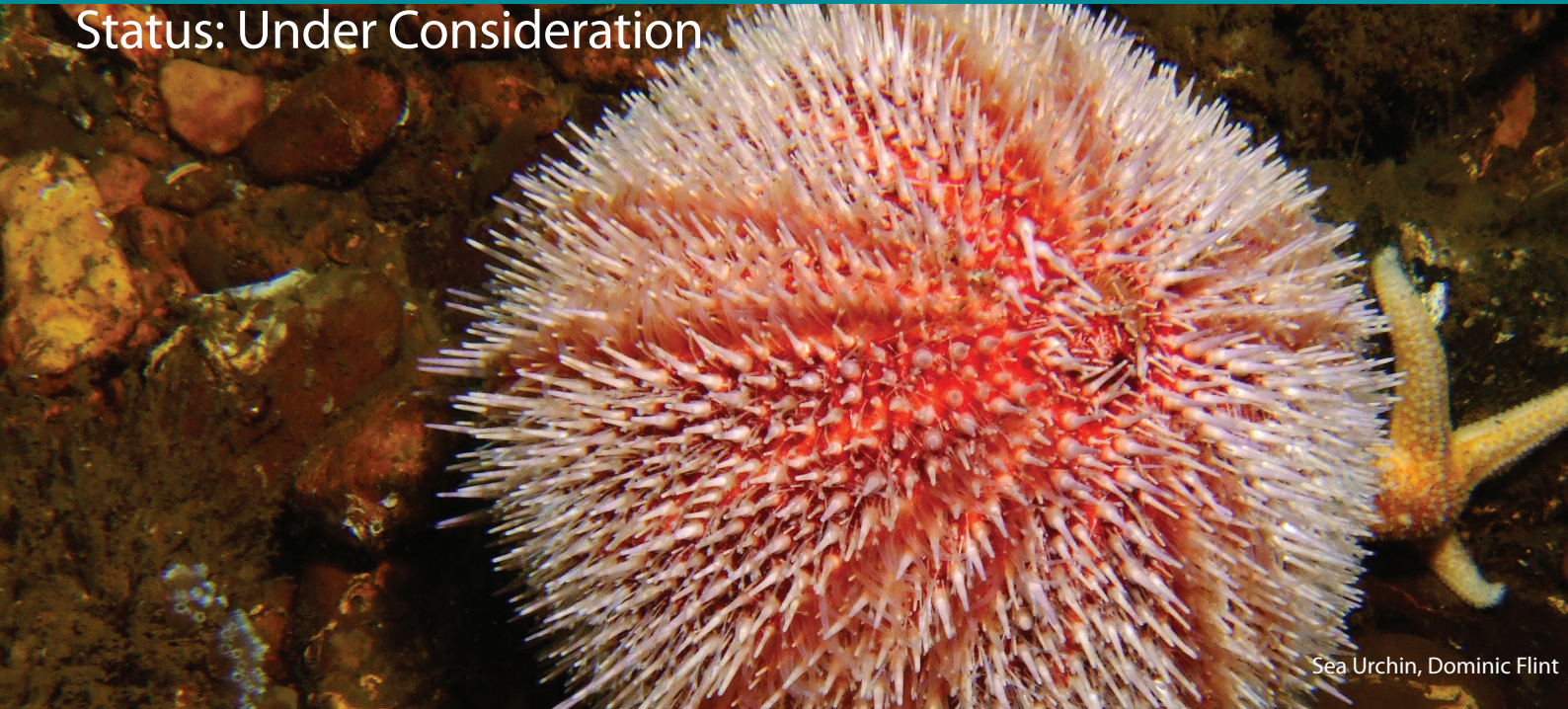
Sea Urchin, Dominic Flint