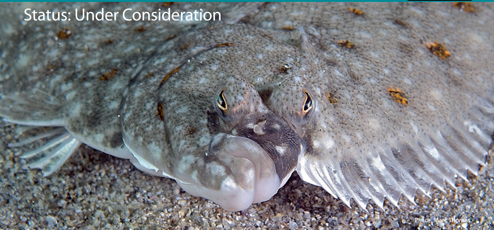
Plaice