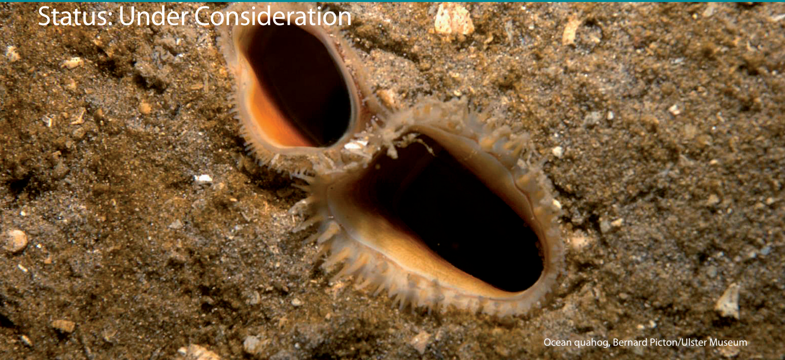
Ocean quahog, Bernard Picton/Ulster Museum