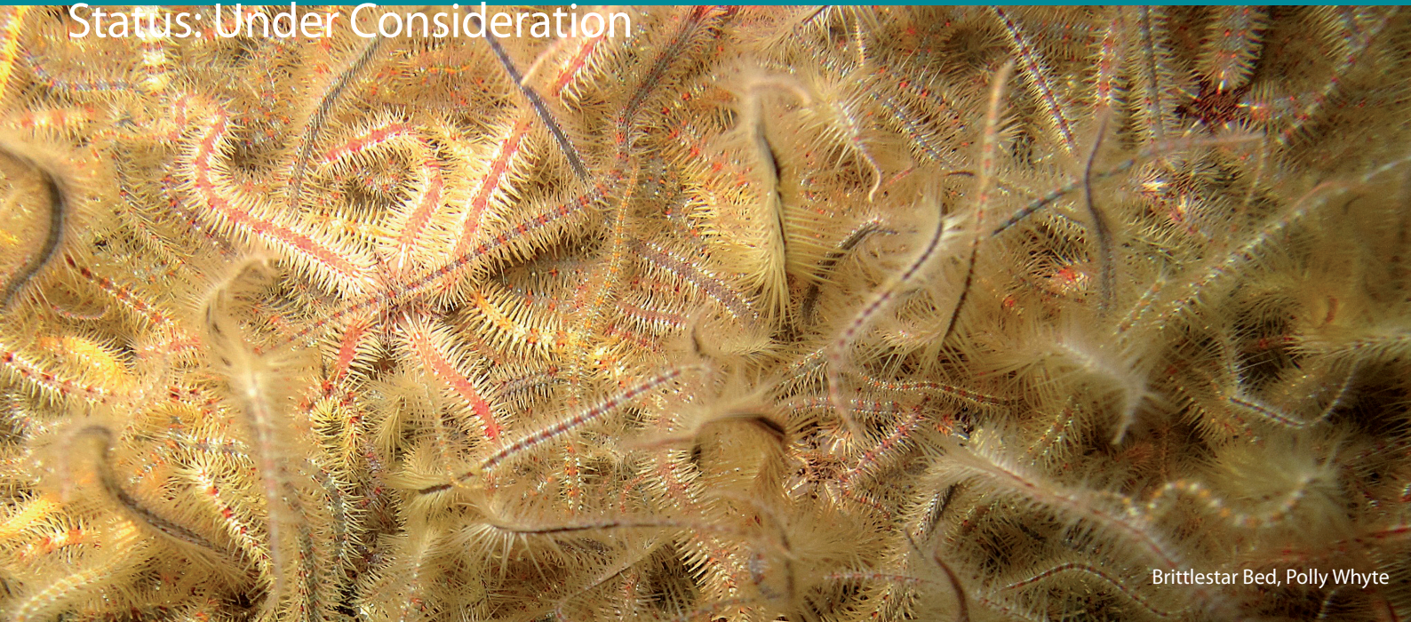
Brittlestar Bed, Polly Whyte