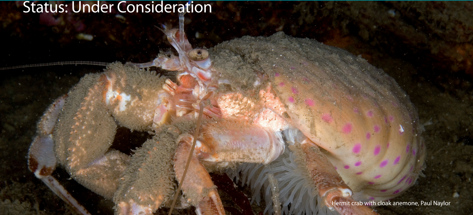
Hermit crab with cloak anemone, Paul Naylor