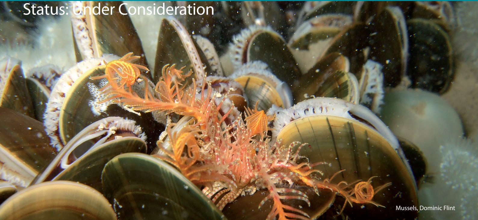
Mussels, Dominic Flint