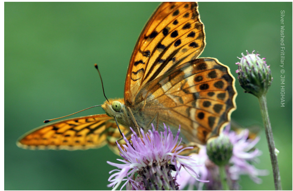
Silver Washed Fritillary