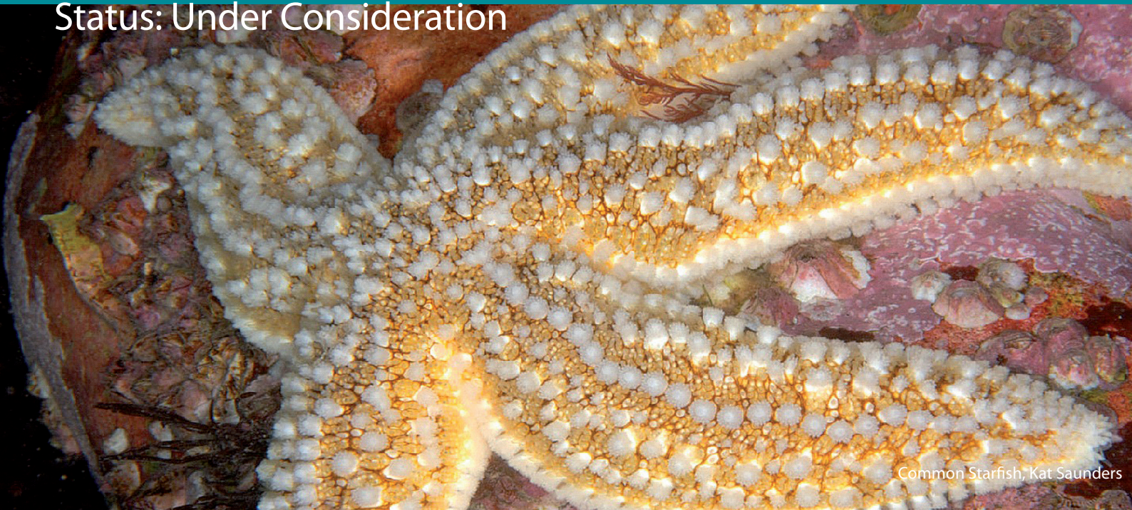
Common Starfish, Kat Saunders