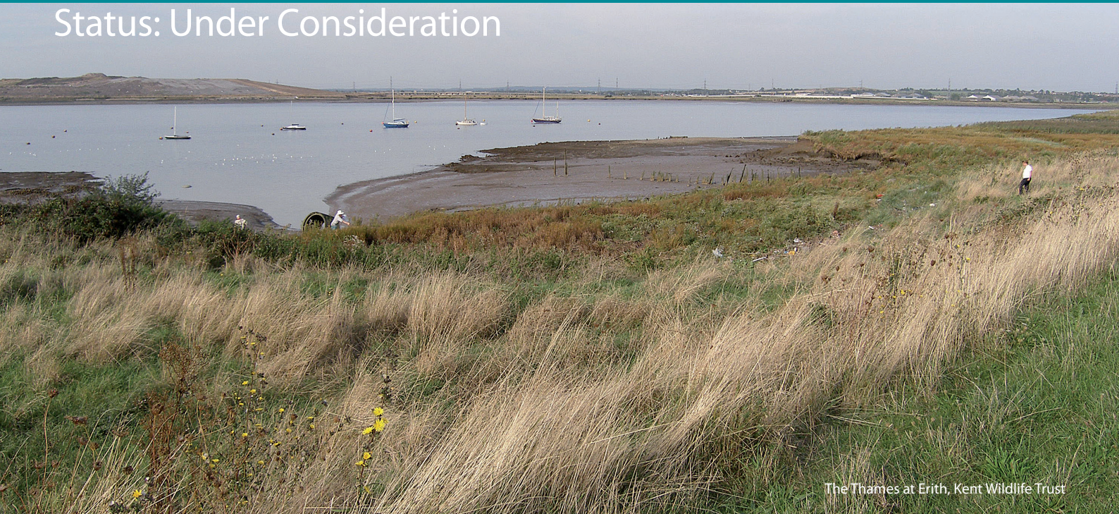
The Thames at Erith