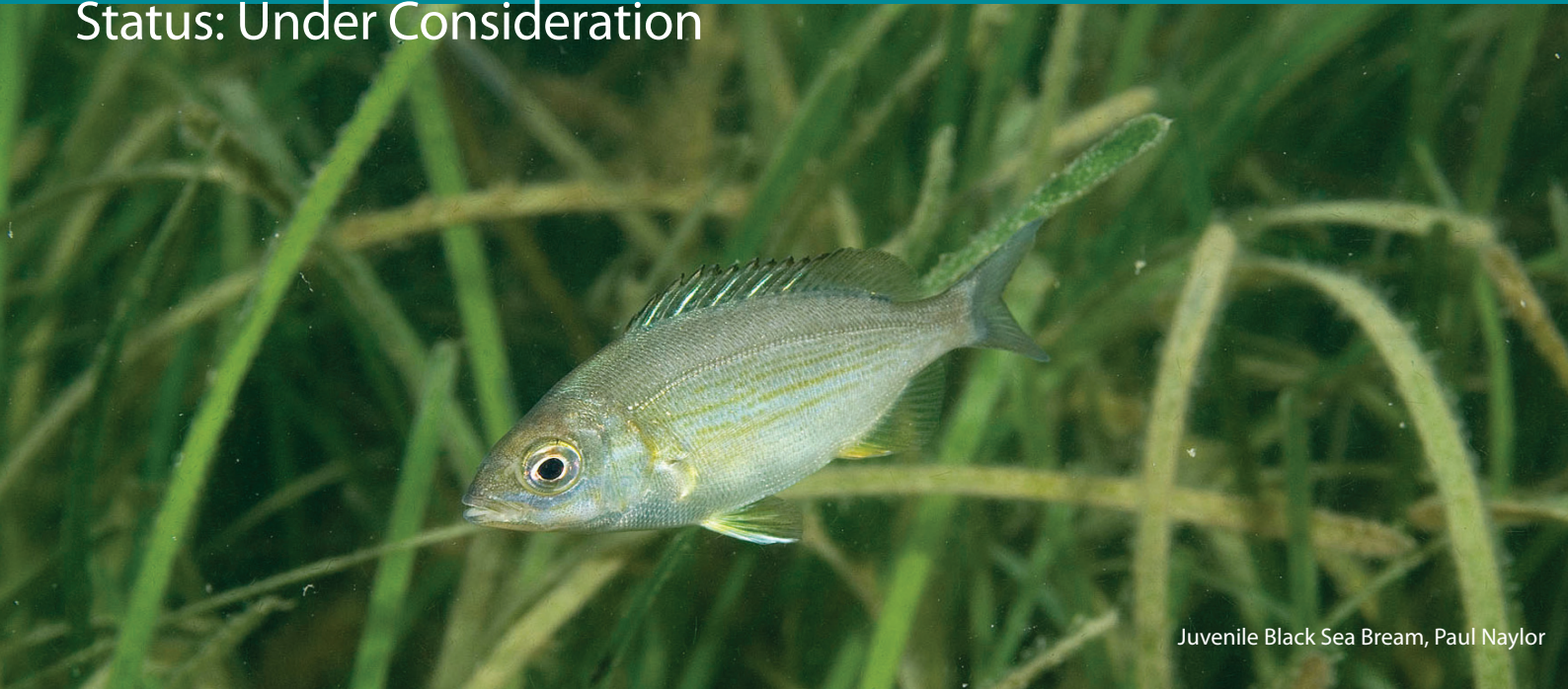
Juvenile Black Sea Bream, Paul Naylor