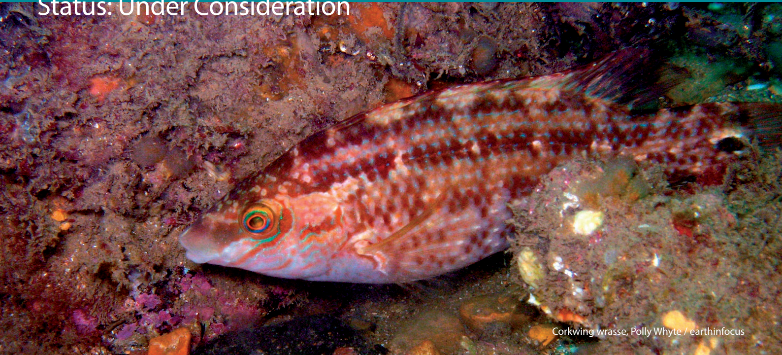
Corkwing wrasse, Polly Whyte / earthinfocus