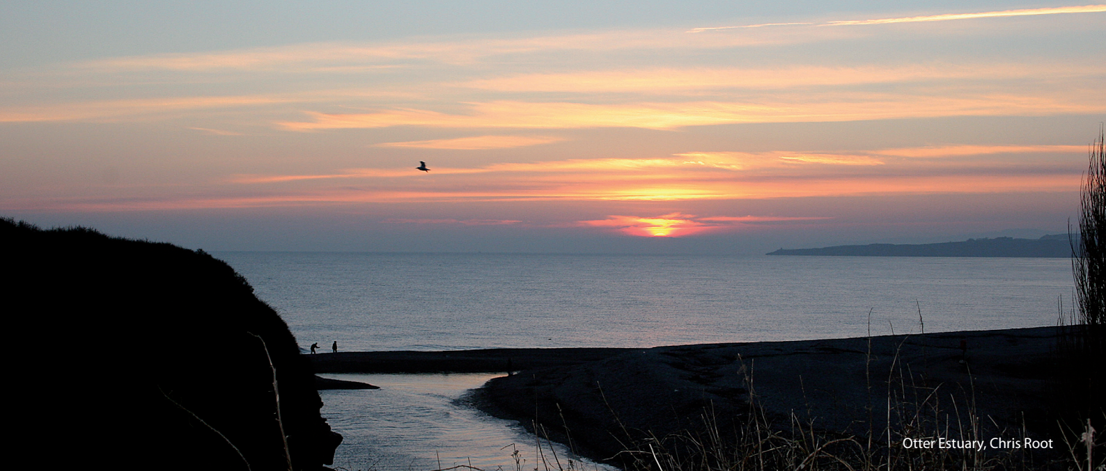
Otter Estuary