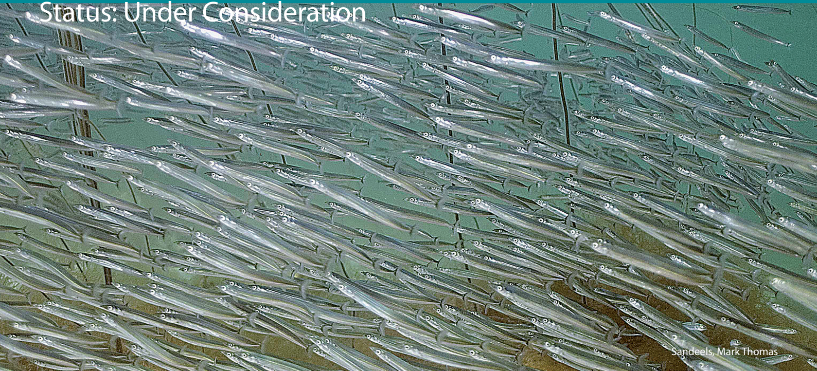
Sandeels