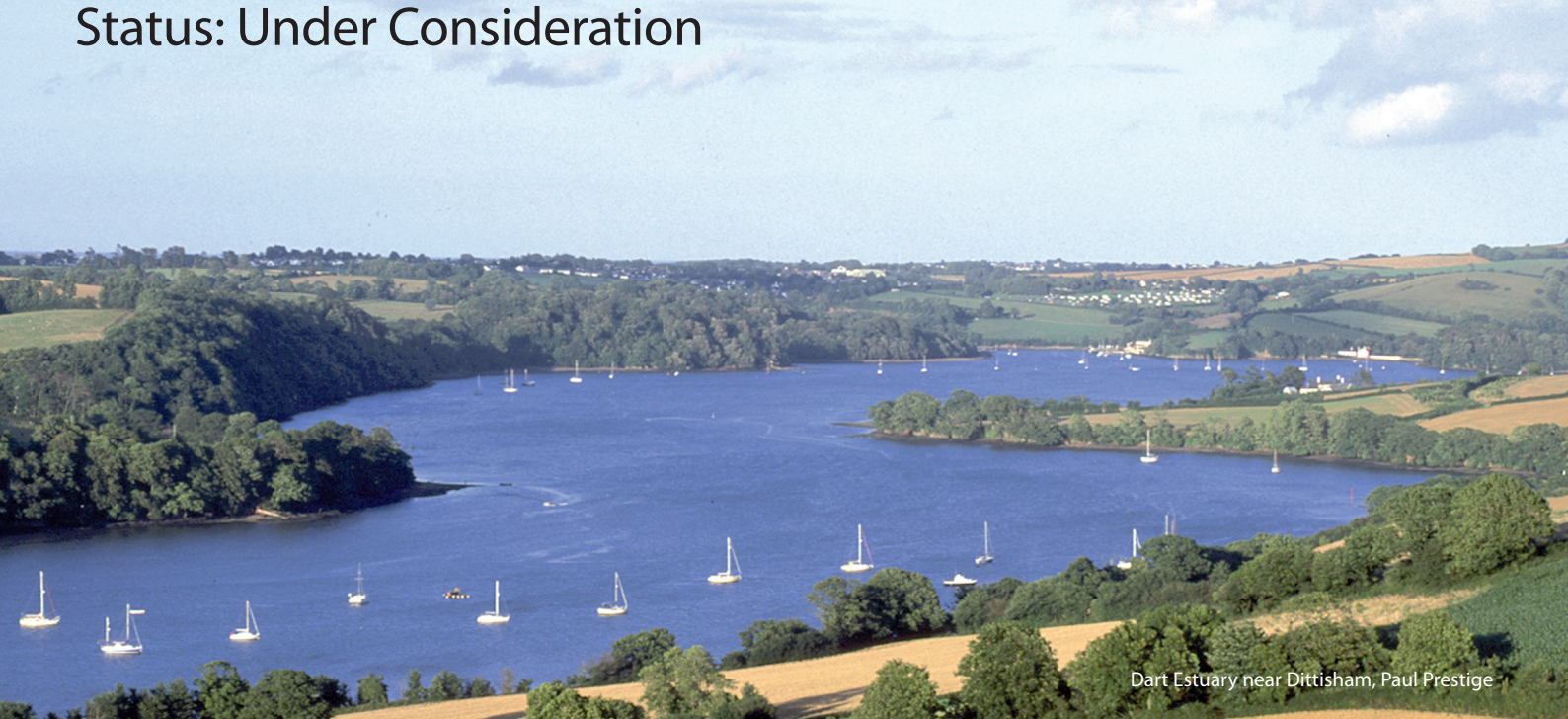
Dart Estuary near Dittisham