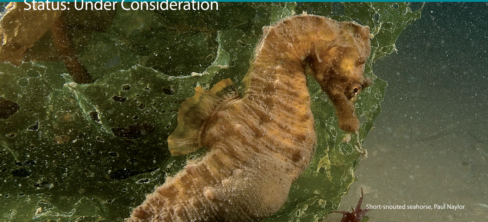
Short-snouted seahorse