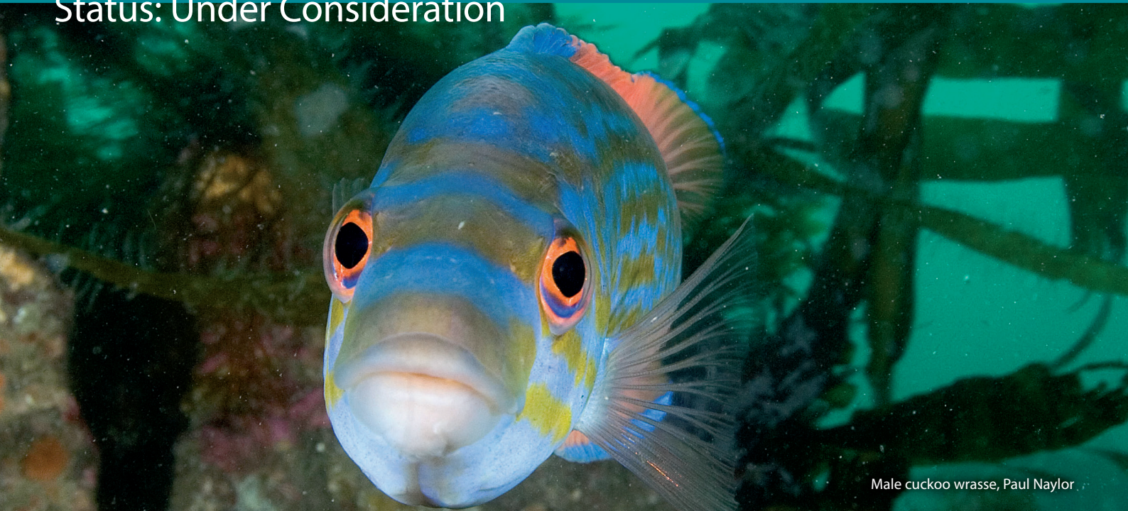
Male cuckoo wrasse