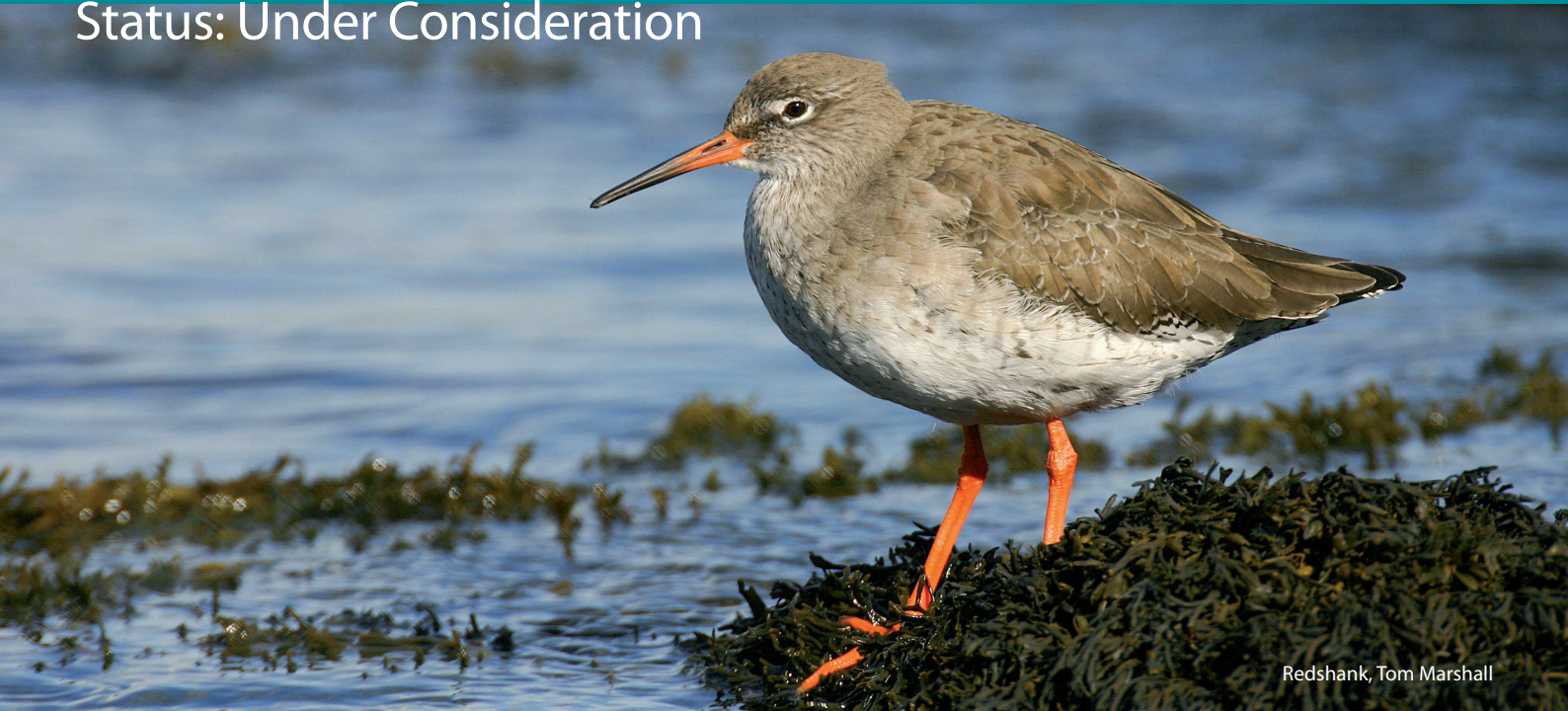
Redshank