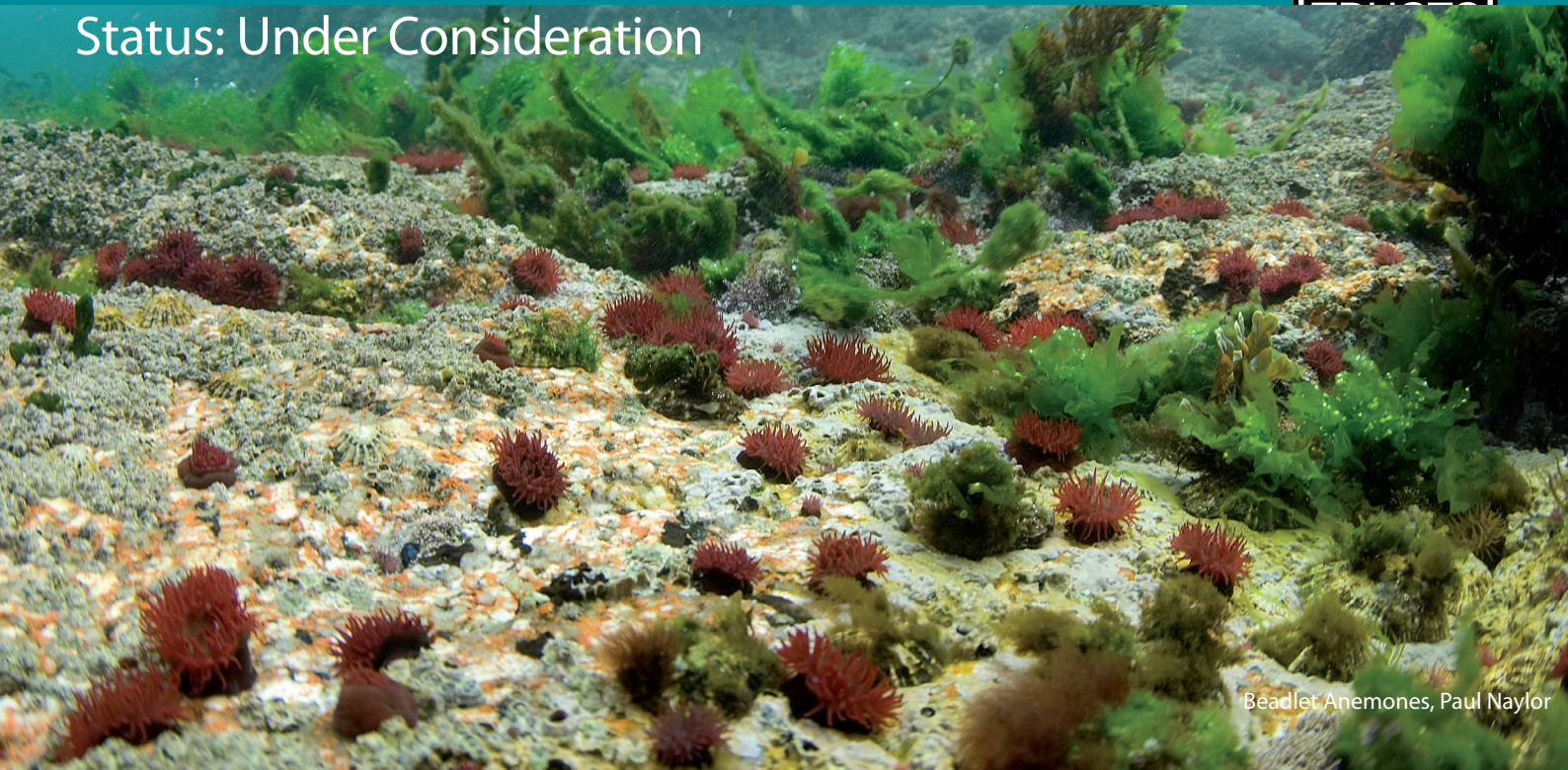
Beadlet Anemones