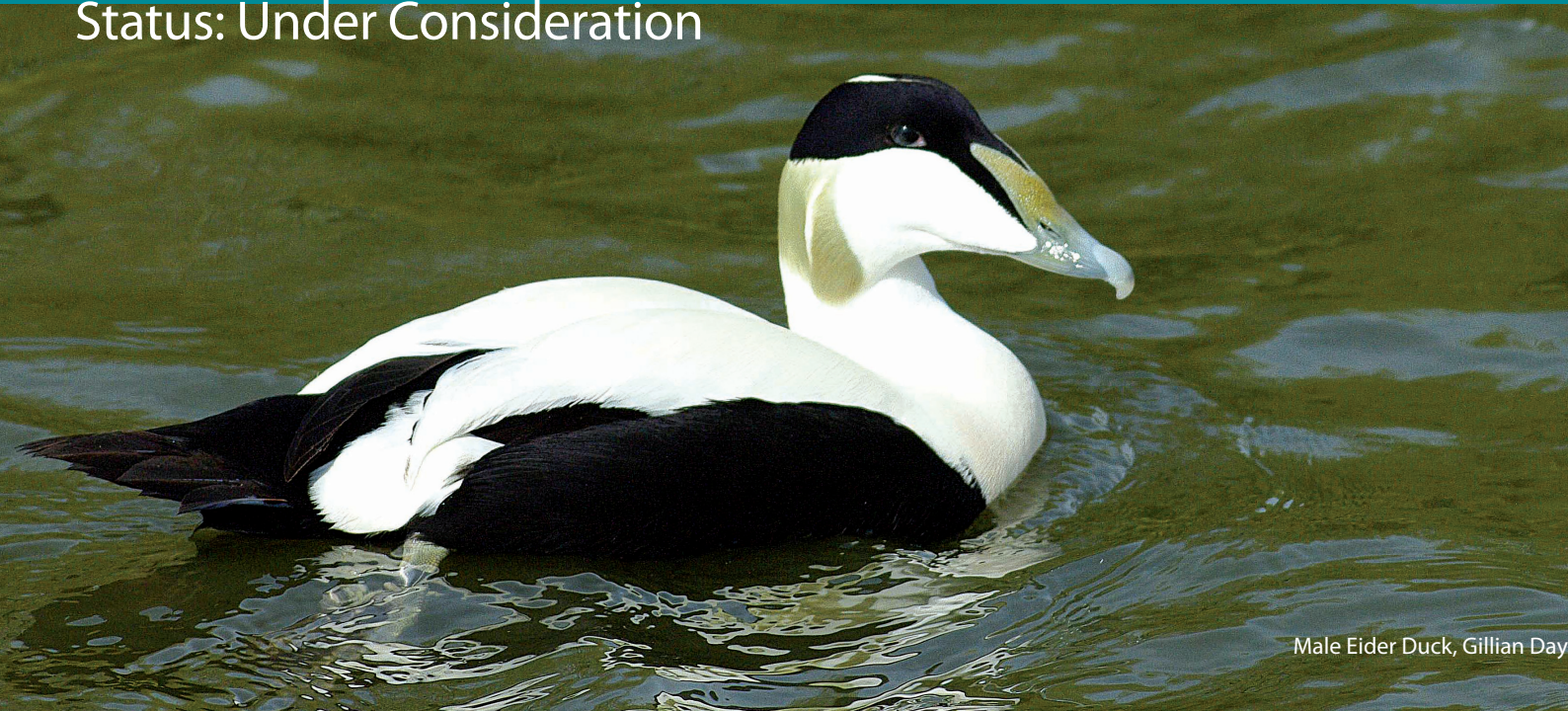
Male Eider Duck, Gillian Day