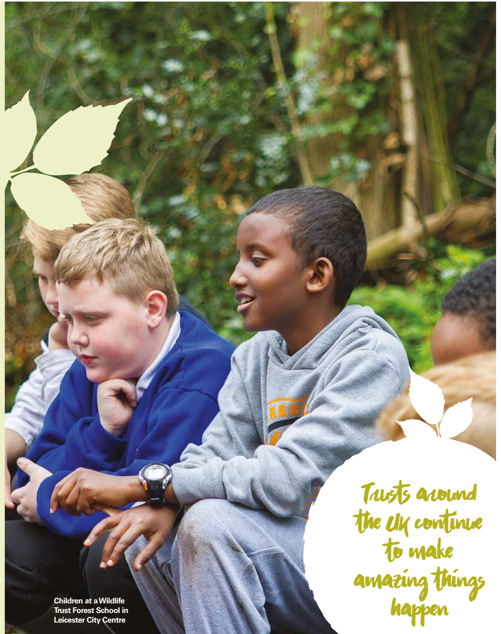
Children at a Wildlife Trust Forest School in Leicester City Centre

Trusts around the UK continue to make amazing things happen