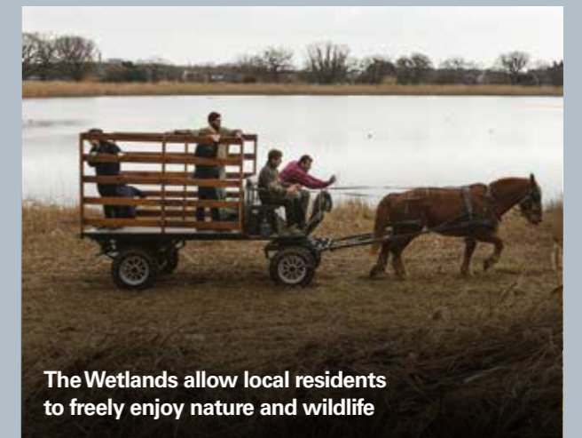
The Wetlands allow local residents to freely enjoy nature and wildlife