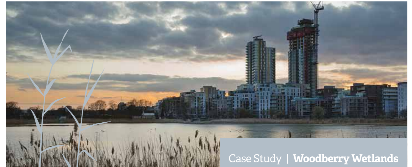
Case Study | Woodberry Wetlands