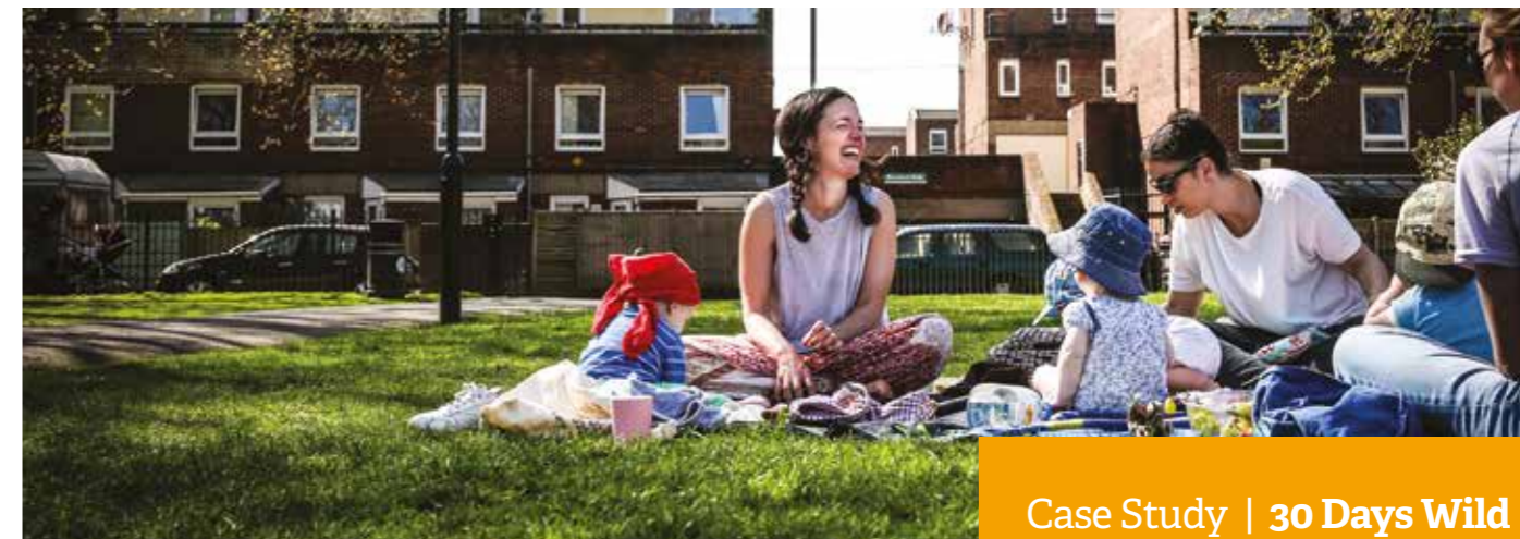
Case Study | 30 Days Wild

Inspiring an early love of wildlife in children has been a central part of our work for decades. Our junior membership, Wildlife Watch, has more than 150,000 members and we run over 200 children's nature clubs. These range from Nature Tots sessions for under-3s to programmes like Lincolnshire Wildlife Trust's Junior Rangers and Bushcraft programmes, which engage young people with nature through their teenage years. This year support from players of People's Postcode Lottery has given hundreds of city-dwelling schoolchildren regular access to nature with new Forest Schools.